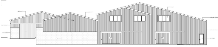
AR30_01 Proposed Elevations 1:100